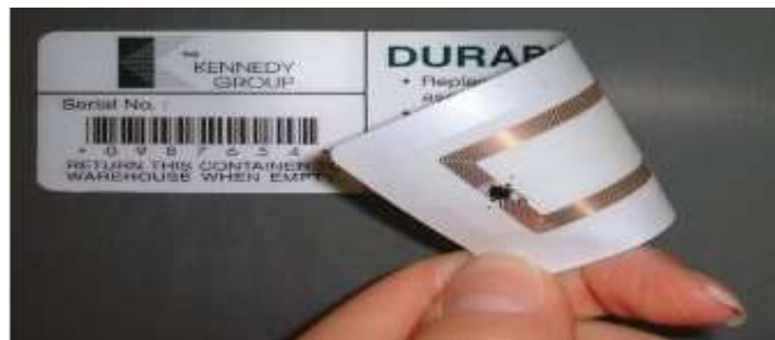
Figure 4. RFID Tag [16]