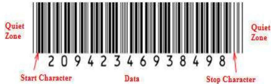
Figure 3. Structure of Barcode [15]