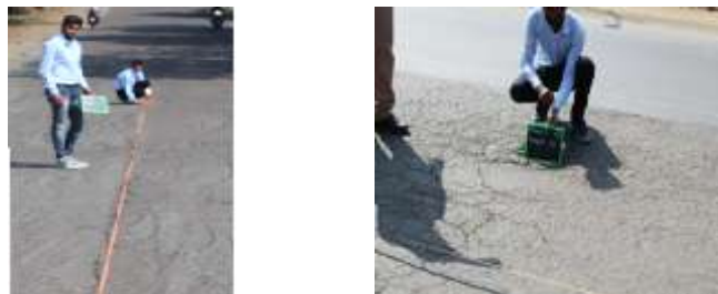
Fig. 1 : Images of onsite detection of cracks

Average cracks in all the roads are shown in figure 2