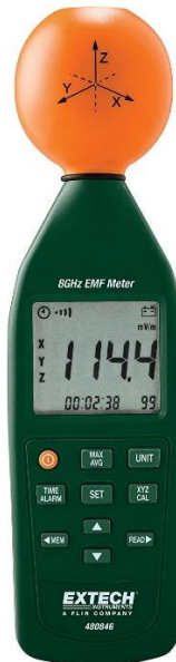
Figure 2. RF EMF Strength Meter Model 480846 device