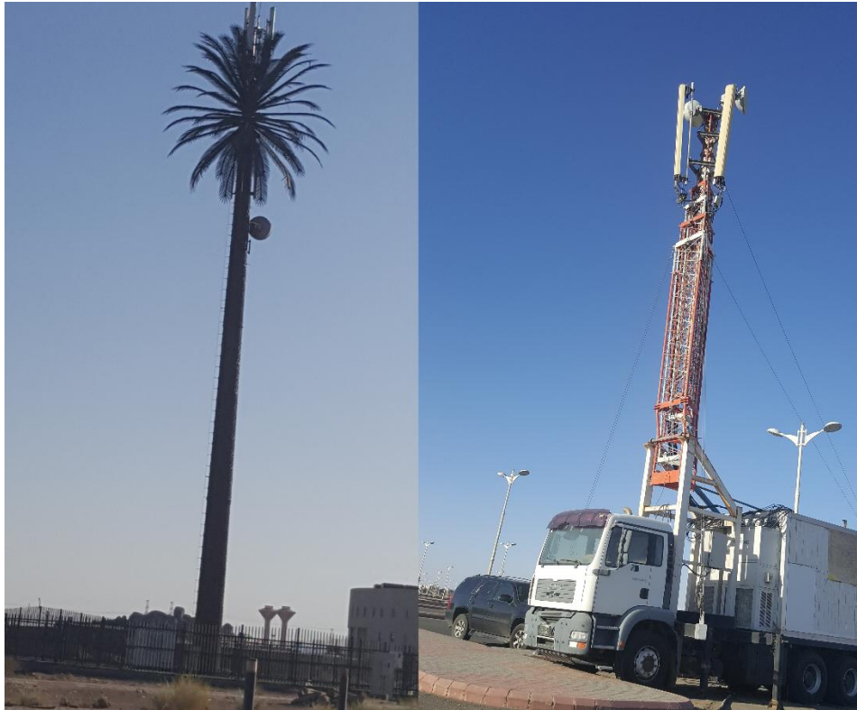
Figure 1. Different structures of base stations observed in Najran city.

The measurement methodology adopted in this paper to assess each site has been taken from the Commutation and Information Technology Commission (CITC) guide- lines [17]. RF field emission from each mobile base station should not exceed the national and international levels of power density as shown in Table 1 is the purposes of the initial site survey to ensure that the people has access outside the site boundary. Also to find the place of the Maximum Peak Point (MPP) around the location in areas which are accessible by the people.